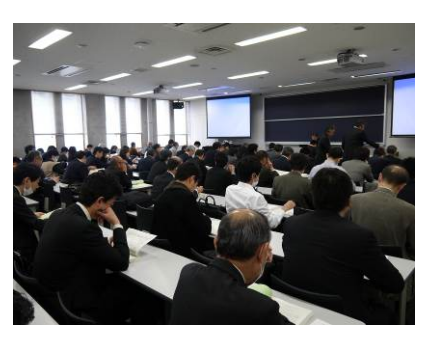
Snapshot of 2013 Spring Conference

Others: Symposiums, forums and seminars are organized to exchange information regarding project management approaches.