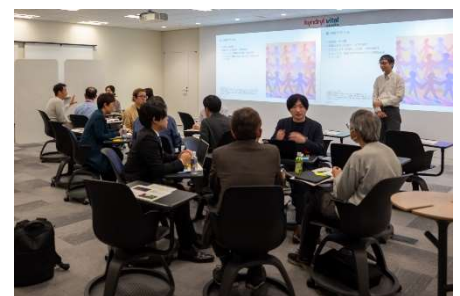
Let's Talk to the Senior PM

SPM is registered as an IPMA member association, and exclusively provides IPMA literatures, such as ICB 4.0, in Japanese to members to support them to get global and advanced knowledge about project, program and portfolio management. SPM also operates the IPMA 4-level Certification in Japanese.