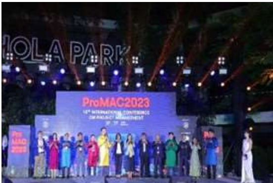
ProMAC Gala Dinner

Others: Other symposiums, forums, and seminars are frequently organized to share project management knowledge, skills, and techniques.