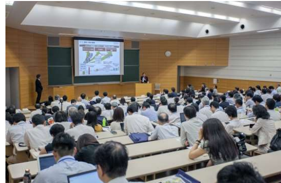
Spring/Autumn National Conferences