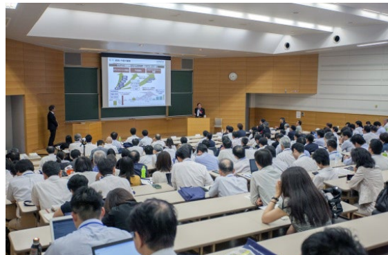
Spring/Autumn National Conferences

Let's Talk to the Senior PM: This casual after-hours meeting is designed to provide basic project management knowledge from senior project managers to those who are willing to learn from practical project experiences. Other symposiums, forums, and seminars are frequently organized to share project management knowledge, skills, and techniques.