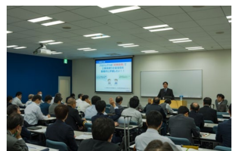
Casual After-hours Meetings