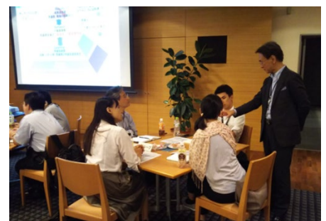
Let's Talk to Senior PM

There are six regional branches in Japan, and each contributes to the development of talents in project management by for project management and stimulating their designated region through research and application of project management.